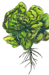
June – Leafy Greens