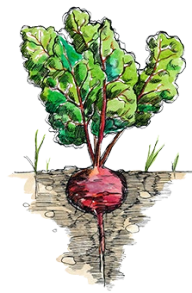
February – Beets