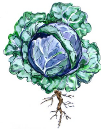
September – Brassicas