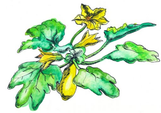
July – Summer Squash