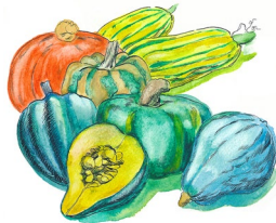
January – Winter Squash