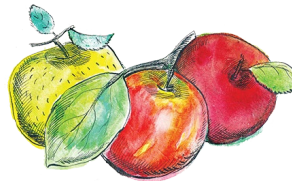
October – Apples