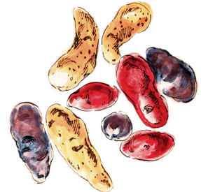
November – Potatoes