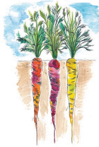
December – Carrots