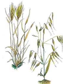
March – Grains