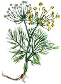
August – Herbs

Although we recommend following this calendar, your school or program can change the order of the calendar to suit your needs. None of the materials are printed with the month. The calendar will likely change each year to include new foods!